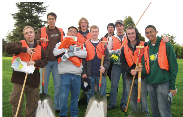
Brothers performed several service projects throughout the year including the “Berkeley Project,” which included students cleaning up areas throughout San Francisco.