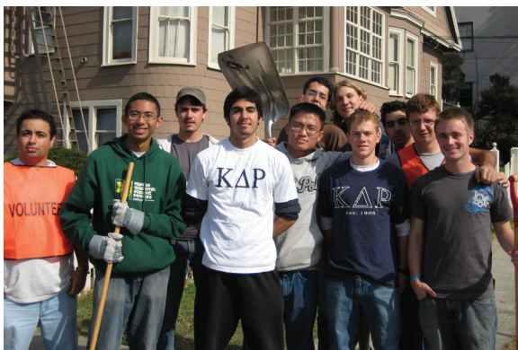
Lambda Brothers volunteer at the Malcolm X Elementary School.