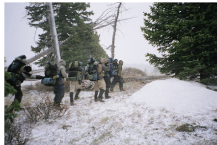
The KDR Wilderness Institute, sponsored by the KDR Foundation brings chapter leaders together on a hike through the Rocky Mountains.

Although our voyage was difficult, we were not the only ones who faced difficult situations in Antarctica. There are approximately 2,000 scientists stationed on Antarctica who live a difficult life. Those with winter posts have to stay on-site for an entire year. During winter months, they are prohibited from leaving the buildings, given the eternal darkness and killer blizzards. They do manage to have a good time though; we had a memorable New Year's Eve bash with the Uruguay science station. We accessed not only their beverage stocks and flushable facilities, but also their scientific knowledge. Global warming, according to the Antarctic scientists, is irrefutable.