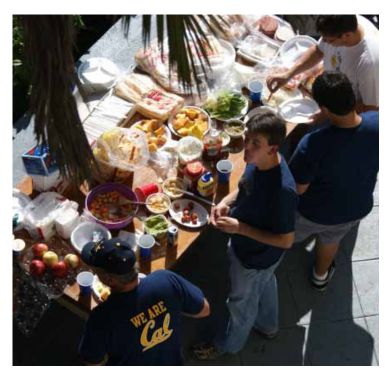
Members of Lambda enjoying the BBQ at Homecoming.

The Lambda Chapter has recently hit a low point and faces one of its greatest challenges. Regardless of the chapter's perceived status, there will always be brothers ready to embody our motto and devote themselves to Kappa Delta Rho. With the prospect of reorganization on the horizon, I am proud to be a member of an alumni board committed to preserving our unique tradition of brotherhood. The challenges ahead are immense, but I am more than confident that many of you will contribute in some way to the efforts that we have begun. I look forward to joining all of you as we work to renovate our property and reorganize our proud chapter.